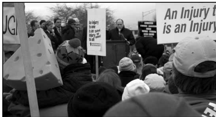
Many labor leaders addressed the crowd.

Local 27 has a successful political action program aimed at maintaining strong relationships with elected officials and ensuring that the reputation of fire fighters and the mission of the fire department are preserved. We are labor leaders, and part of city government, and we have a vested interest in the success and viability of all Seattle. We will continue to work with our elected officials to make sure Seattle is a place where citizens are safe, fire fighters and paramedics are properly prepared and equipped, and working class folks are respected and treated fairly. It is our duty to do so.