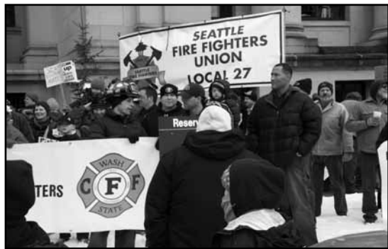
Local 27 in full force.

As Seattle Fire Fighters we show up to the station each shift ready to respond and serve and mentally prepared for the emergencies we may face. Our families all understand, as do we, the inherent dangers that exist in responding to house fires, car fires, warehouse fires, boat fires, car accidents, gas leaks, or medical emergencies, just to name a few. We jump on the rigs when the bells hit without a second thought, with speed, with confidence, and with a deep commitment to help the citizens we serve. We accept the risks that come with each incident because we have seen the heartbreaking