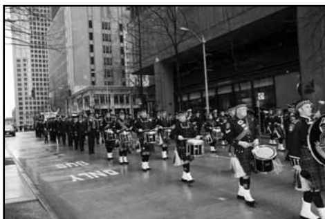
Our uniformed fire fighters march behind the Pipes & Drums

The parade began at 4 th and Jefferson and ended at the Westlake Mall. Mayor McGinn and dignitaries led the parade (behind King