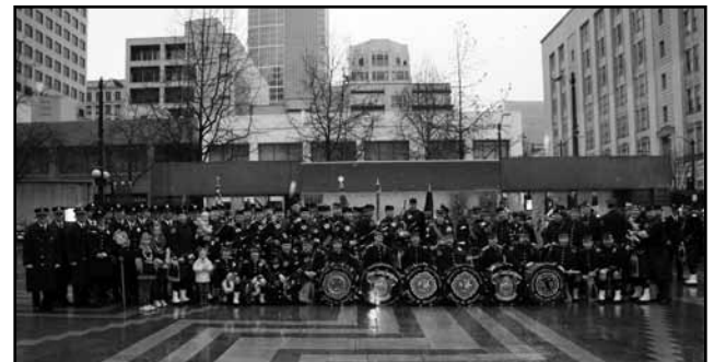
Group photo at the Westlake Mall

While the parade itself ended at the Westlake Mall, many participants took advantage of free monorail rides to the Seattle Center where there are additional events scheduled including lectures, art exhibits, traditional Irish dancing demonstrations, children's contests, food, beverages, and Celtic/Irish products for sale. The closing ceremonies were held at 2 P.M.