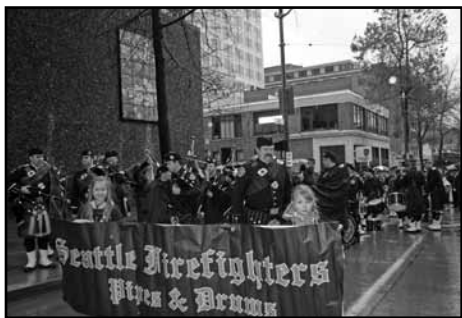
Ready to march behind banner holders

The 39 th Annual St. Patrick's Day Parade was held on Saturday, March 12 th , 2011.