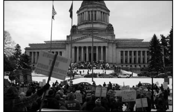
Capital Building, Olympia.